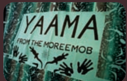
Indigenous Unit, Moree