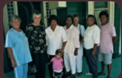
The Granniators, Moree