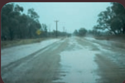
Road to Pilliga