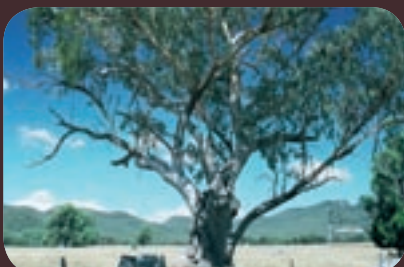
Tree near Moree