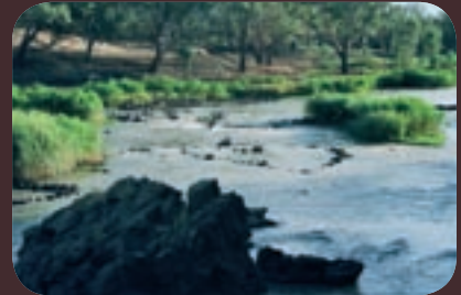
Fish traps, Brewarrina