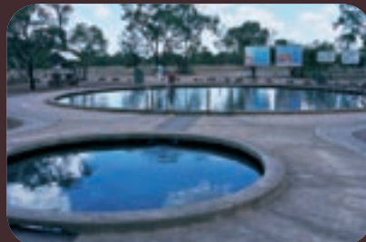
Artesian pool, Lightning Ridge