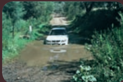
Travelling near Moree