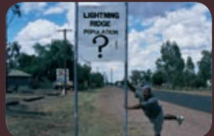
Merv Bishop & population sign at Lightning Ridge