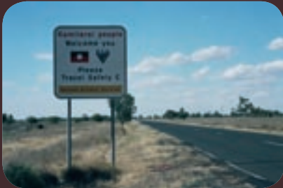
Sign on the way to Walgett